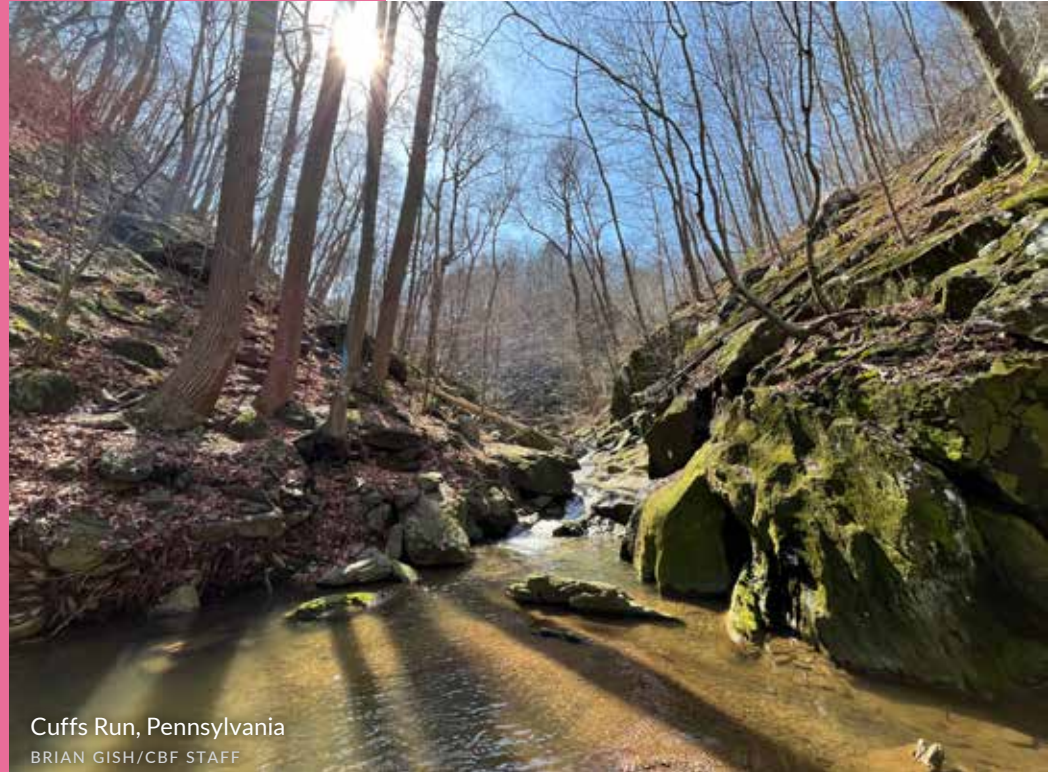
Cuff's Run, Pennsylvania

with the Environmental Protection Agency (EPA) on behalf of residents in South Baltimore who are suffering from disproportionate health risks due to pollution from Maryland's largest trash incinerator. CBF and the Environmental Integrity Project are representing South Baltimore Community Land Trust in the complaint.