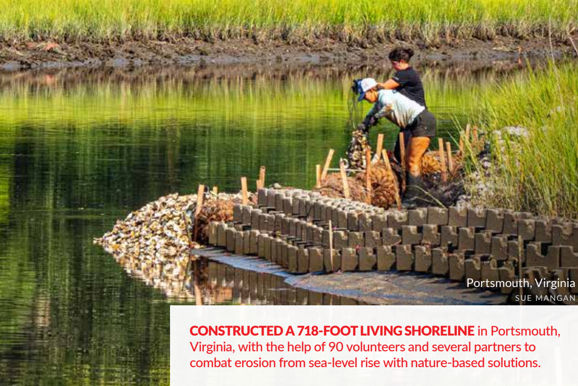
Portsmouth, Virginia SUE MANGAN

GREW 20,000 NATIVE TREES , representing 44 varieties, at CBF's Clagett Farm tree nursery, which supplies trees for plantings throughout the region.