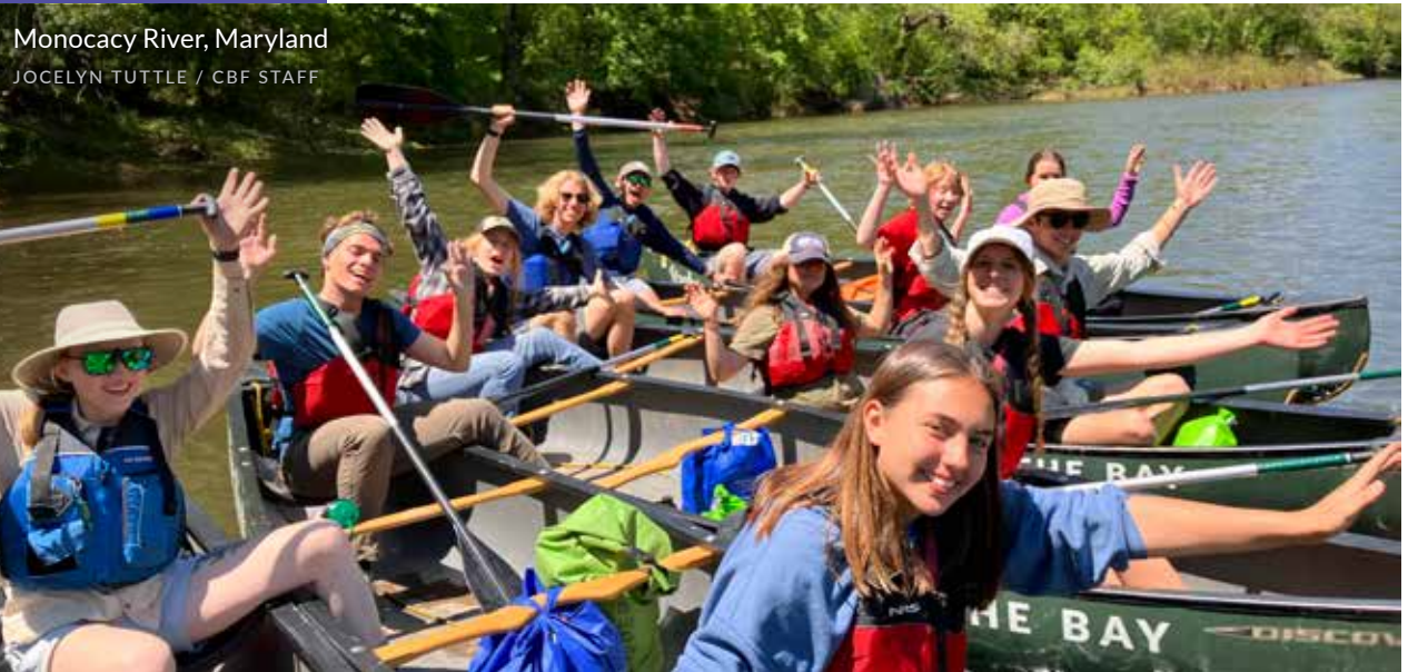
Monocacy River, Maryland

ENGAGED 60 STUDENTS from Maryland's Anne Arundel County in CBF's first climate change-focused field experience and kicked off a new student-centered climate literacy curriculum with Newport News Public Schools in Virginia.