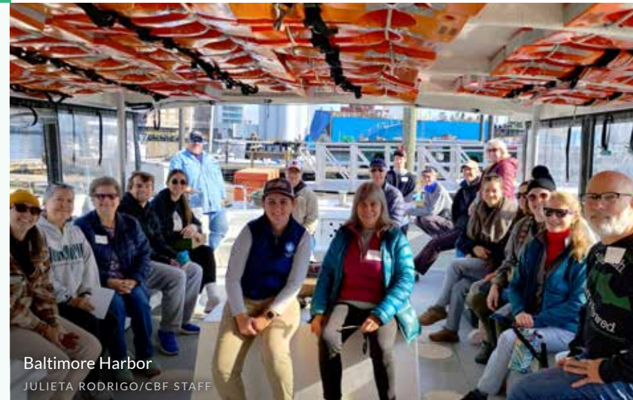
Baltimore Harbor