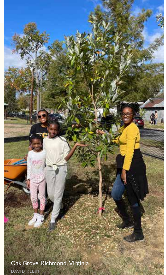
Oak Grove, Richmond, Virginia DAVID KLEIN

HELPED COMMUNITIES in conservation efforts, including in Southside Richmond. CBF hosted tree plantings to increase tree cover and cool temperatures in formerly redlined neighborhoods, which are still suffering from inequalities after decades of discriminatory housing practices.