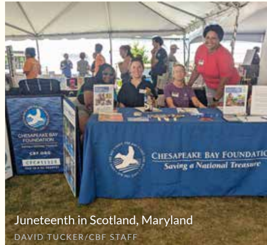
Juneteenth in Scotland, Maryland

SUPPORTED PARTNER GROUPS THROUGHOUT THE WATERSHED, such as the Nansemond Indian Nation in Virginia in its successful efforts to regain 71 acres of their riverfront ancestral land after centuries of displacement. CBF will continue to work with the Tribe on conservation projects to restore this sacred land.