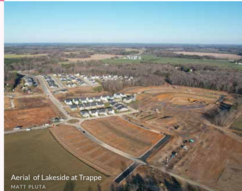
Aerial of Lakeside at Trappe MATT PLUTA

decision to uphold the Maryland Department of the Environment's wastewater discharge permit for the Lakeside at Trappe development on Maryland's Eastern Shore. The permit allows the use of spray irrigation to discharge 100,000 gallons of treated wastewater per day onto Talbot County farm fields, leading to increased nitrogen and phosphorus pollution in already-impaired nearby waterways.