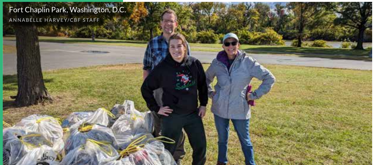
Fort Chaplin Park, Washington, D.C.